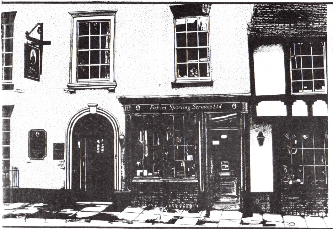
Fosters shop front as it now is.